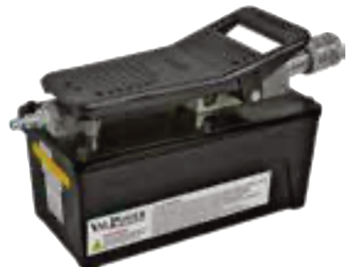
Pneumatic Pump included: SAP # 20244932 10,000 PSI. 100 cu in (1,639 cc) Reservoir capacity