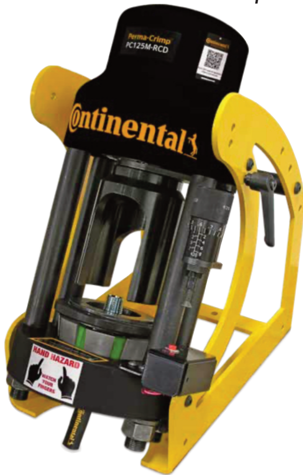
PC125M-RCD crimper comes with 5 dies & air/hyd pump $4,700.00 value

FREE PC125M-RCD Portable Series Crimper with a $6500.00 minimum order of any Continental items in this brochure. While quantities last, prices subject to change